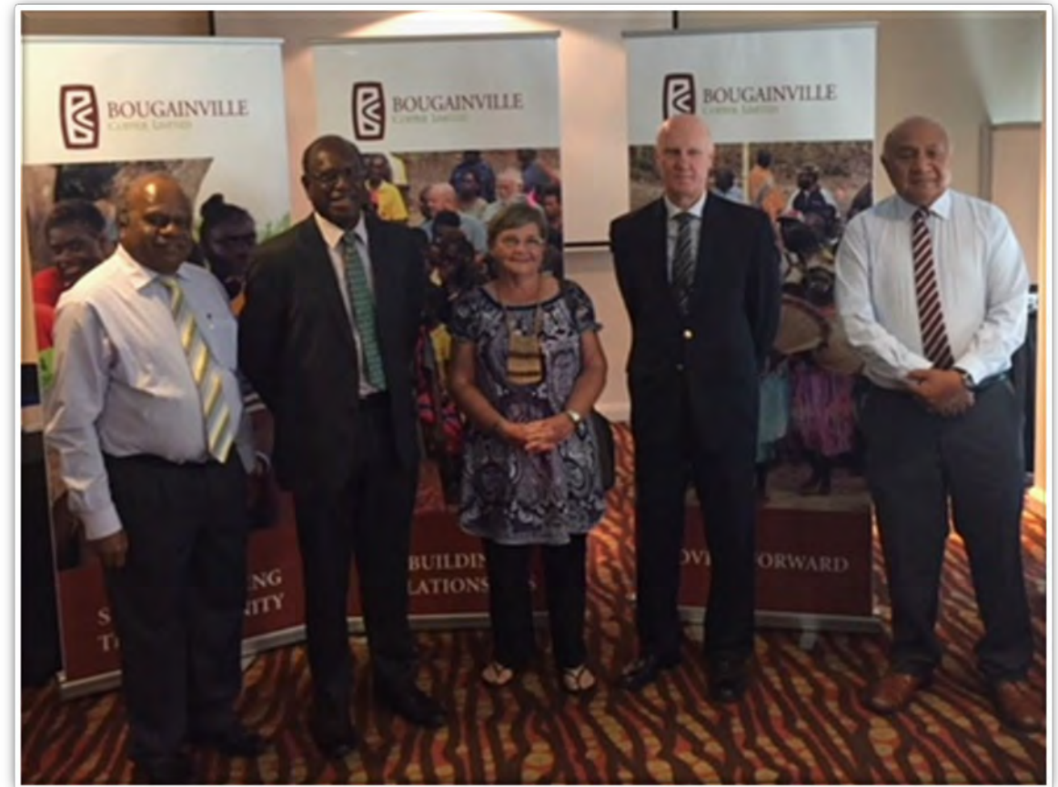
Board members at the 2018 Annual General Meeting